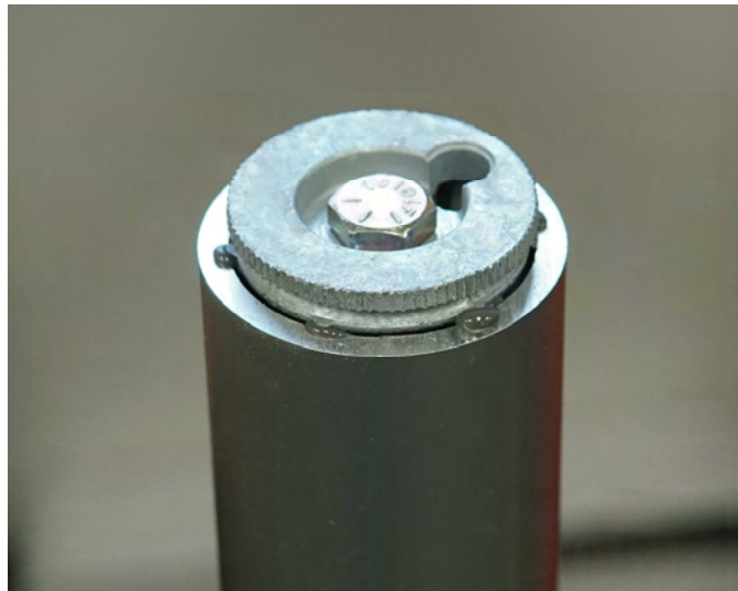
T07 connector in R02 pipe