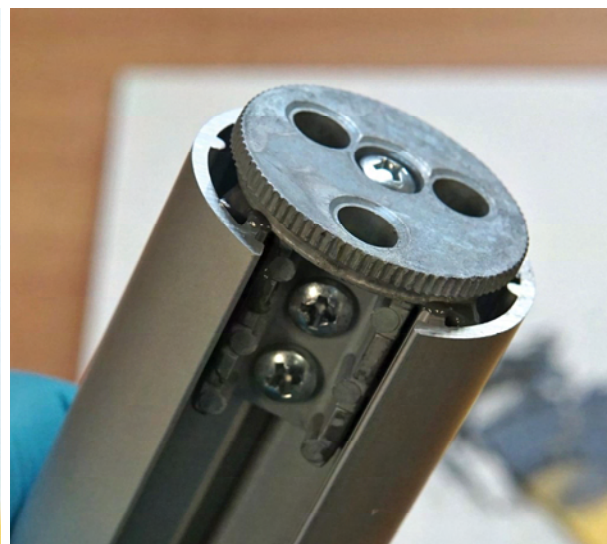
T06 connector in R01 railing